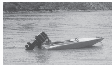
Joey's first ski boat. 16 foot '69 Regata ski boat with a 125HP Mercury. Giddy up!